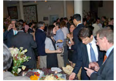
Benefactor Cocktail Party...

Thanks to all who helped out in so many ways this year at Caedmon, whether or not you were able to attend the Benefactor Reception this week. Enjoy more photos from the event in the left sidebar.