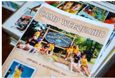
"Rookie Camp" Q&A...