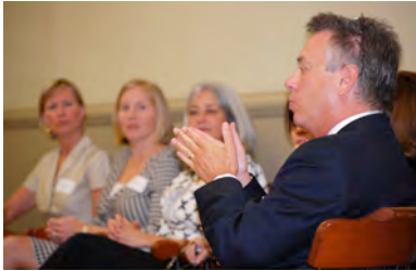
...Middle Level Admissions Panel