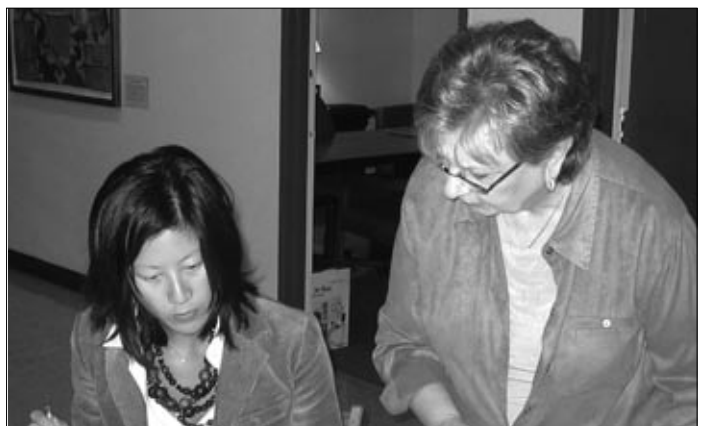
Some Annual Giving Class Liaisons get ready to begin the 2005 Phonathon on October 18th.