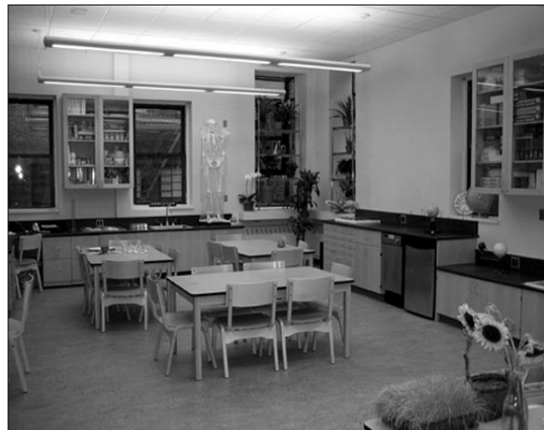
Caedmon's new science room and gymnasium...