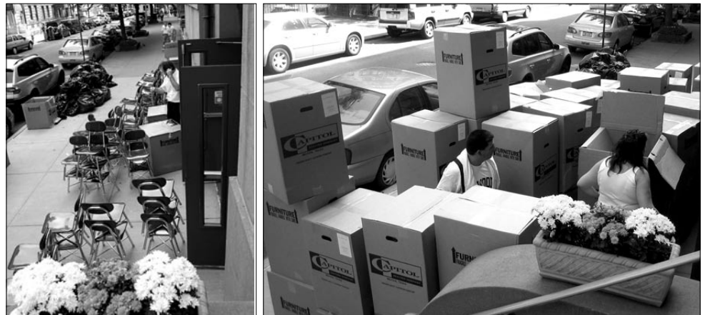
For one of the many new improvements completed this summer, we received a huge shipment of chairs for the new lunch room tables. Unpacking them was quite a task!